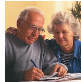
An informed investor is much less likely to become the victim of an investment scam.

Violating campaign laws or misusing public office to win an election isn't just "politics as usual" or "dirty tricks" – it's a crime. Danny advocates aggressive criminal prosecution and severe penalties for everyone involved in such criminal acts.